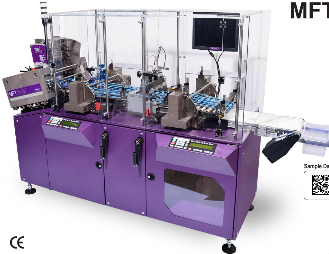
Sample Data Matrix Barcode