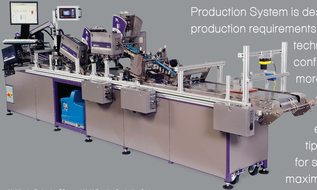
Multifeeder Technology ® Compact Multi-Function Production System

The Multifeeder Technology ® Compact Card-Line Production System is designed specifically for today's production requirements. Small footprint, advanced technology, user-friendly, and configurable operations give you more production flexibility than a single-purpose production system. Inline mag-stripe encoding, verification, and tipping minimizes the need for secondary operations and maximizes data to significantly increase your production efficiency.